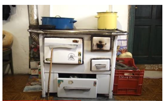
Picture 4 and 5. Dobrila and her husband in the old house (besides the newly built) still use a 53 years old stove for baking food

Current practise in the Western Balkans that has been noticed from contacts in all WB6 markets suggests that there is no operating system in place when it comes to waste disposal of disused household heating stoves. This device is dealt with in accordance with laws governing general municipal waste. The reason for this is mainly the fact that there are no fees covering this particular product, as, for example, there exists the fee for refrigerators, computers, car batteries, tyres and similar. Main manner of disposing of this kind of waste in all WB6 is highly