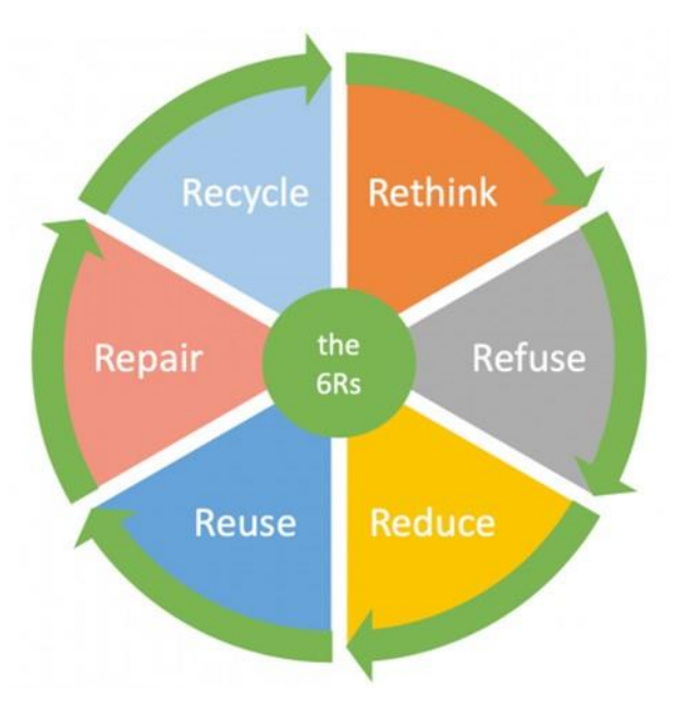
The 6R process of circular economy picture