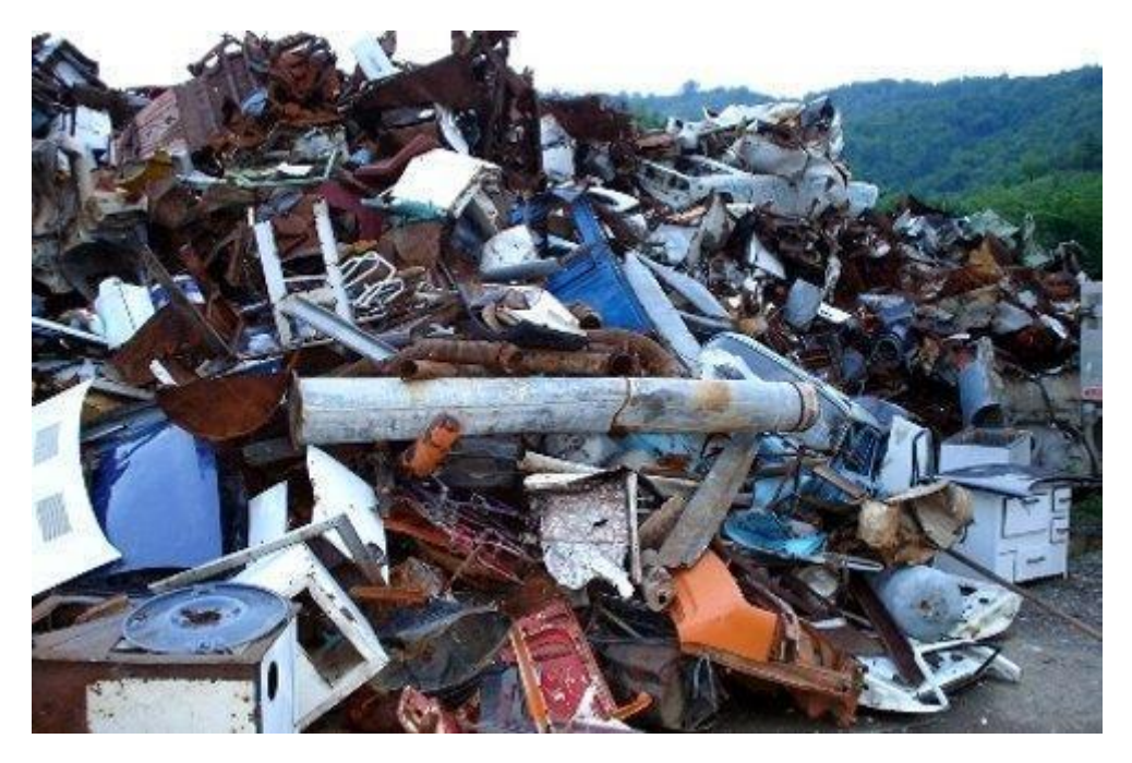
Picture 3. Scrap metal collection centre (there is one visible solid fuel stove in the whole yard)

Before entering into this part of the analysis, it is surely a place to state that when this topic was discussed with numerous scrap metal dealers, one thing they mentioned that they hold in common is the following: "Smederevac ? Oh, yes, we do get one, every now and then!" What can be concluded is that old solid fuel stoves are becoming scrap metal only when all other usage forms are out of question and there is no other creative way for its prolonged and repeated use. In Šumadija area in central Serbia, as well as in many rural parts of all six Western Balkan markets researched, the solid fuel disused household heating stoves are used for many purposes, other than those they were originally meant for – to heat and to prepare food.